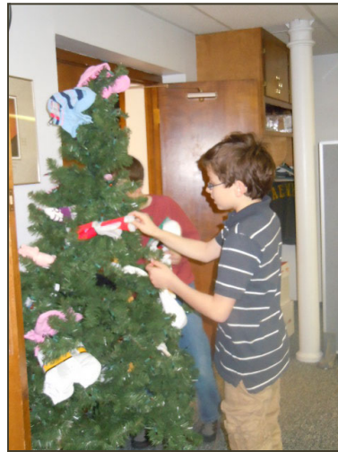
Left - Our Sock/Mitten Tree filled with your donations!